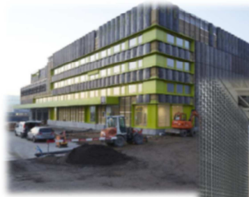
86 Kooperative Speicherbibliothek Schweiz (Cooperative Storage Facility Switzerland). Büron, Switzerland