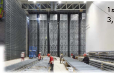
1st module (on 3) : 3,100,100 volumes